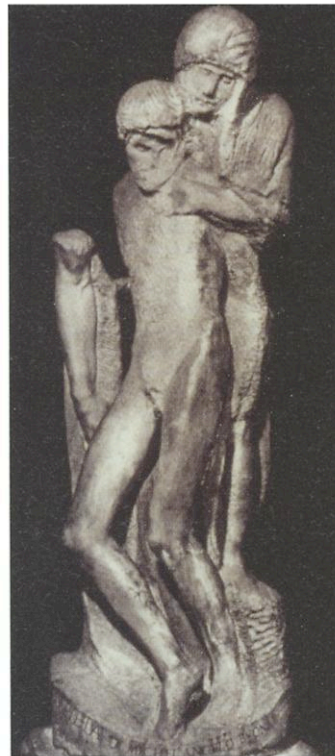
The Rondanini Pietà. —Michelangelo Buonarroti

brain function—questions that are fundamental in man's quest to understand himself. Like art, these play a critical role in our lives and are also subject to the quality of variability that is at the heart of our civilization. I shall be surprised if such an understanding does not modify radically our view of ourselves and our societies.